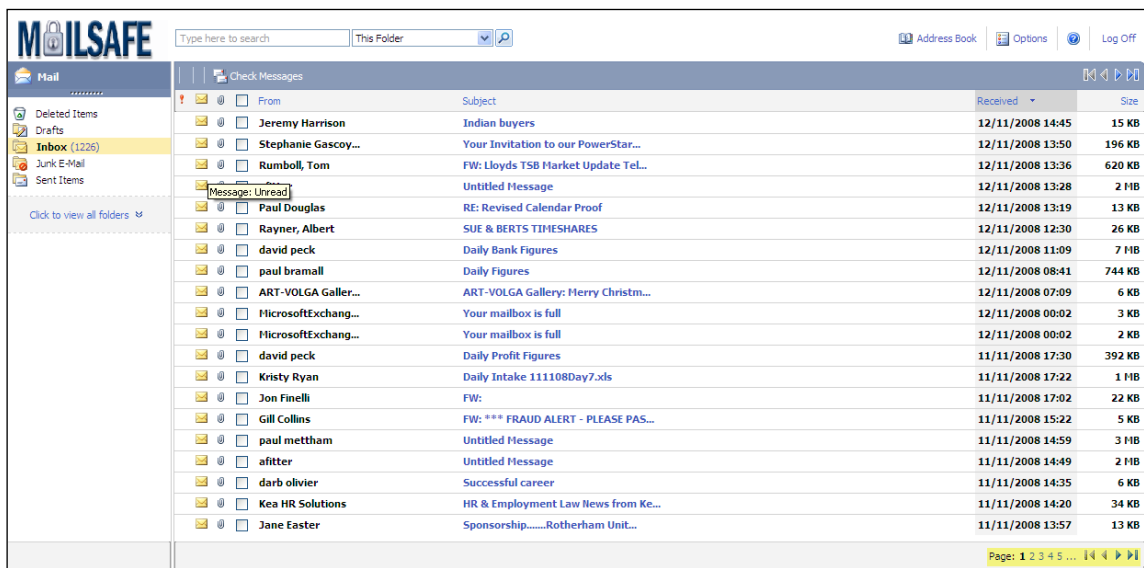
Figure 2 – The MailSafe Inbox

2.1 Once logged in, you will be presented with your MailSafe inbox where you can view the email journal for your organisation (see Figure 2). Simply use the forward and backward arrows or select a specific page number from the navigation in the bottom right corner of the window to browse your email journal.